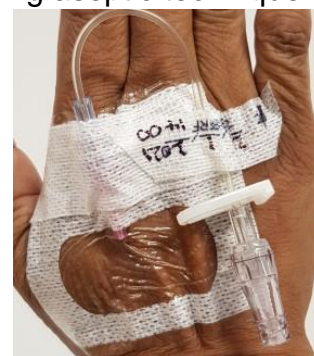
Figure 2: Example of PIVC Dressing