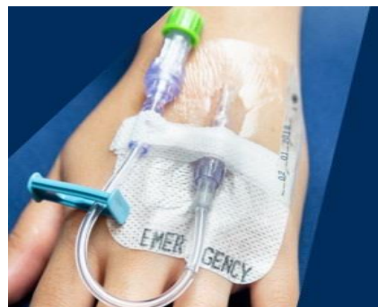
Figure 3: Sample emergency insertion IV dressing

PIVC insertion in the Peri-operative setting is routinely undertaken by Anaesthetists who specialise in this procedure. In this unique environment some modified insertion practices may be applied as follows: