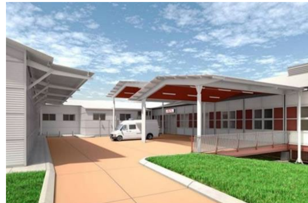
Broome Health Redevelopment 2016 - $60 million

Primary health care facility providing a comprehensive, integrated primary health care service.