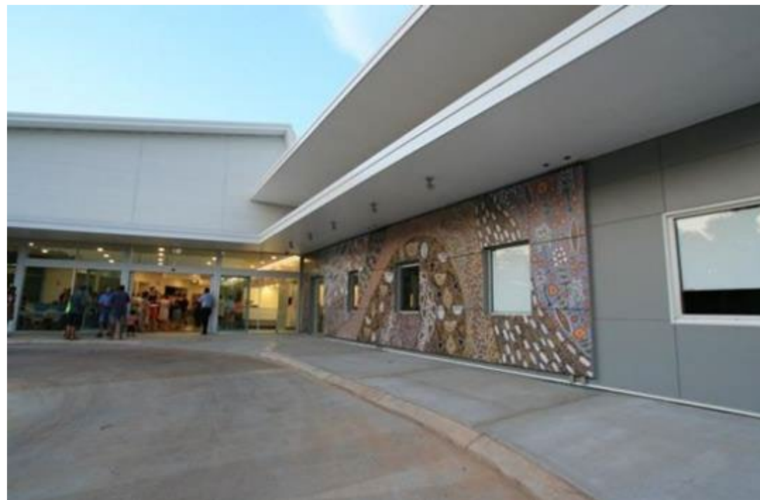
Kununurra Primary Health 2016 - $20.5 million

Primary health care facility providing a comprehensive, integrated primary health care service.